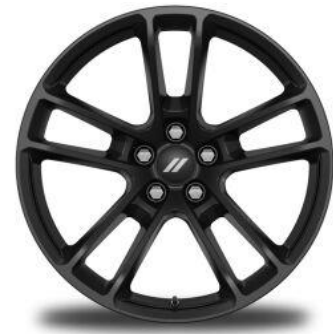
20X11-inch Split 5-Spoke Low Gloss Black Aluminum Wheels Sales code: WSG