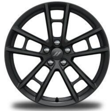
20X9.5-inch Forged/Painted Aluminum Wheels Sales code: WRV