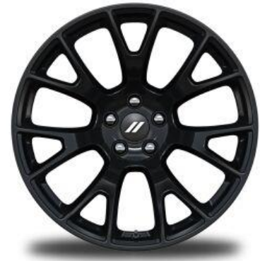
20X11-inch Carbon Black Warp-Speed Aluminum Wheels Sales code: WHW