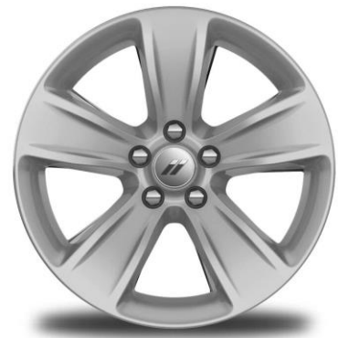
18x7.5-inch Satin Carbon Aluminum Wheels Sales code: WK1